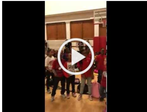
Gophers and Bruins College Chant

From K4 to 8th grade scholars performed their college chant. Chants were written by teachers, EAs and scholars. All the performances were positive, poised and full of team spirit. I can't wait till our next one on 10/12!! Watch the video below of our 2nd grade Minnesota Gophers and UCLA Bruins.